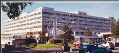
John Radcliffe Hospital Oxford