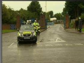
Main Gates RAF Lyneham