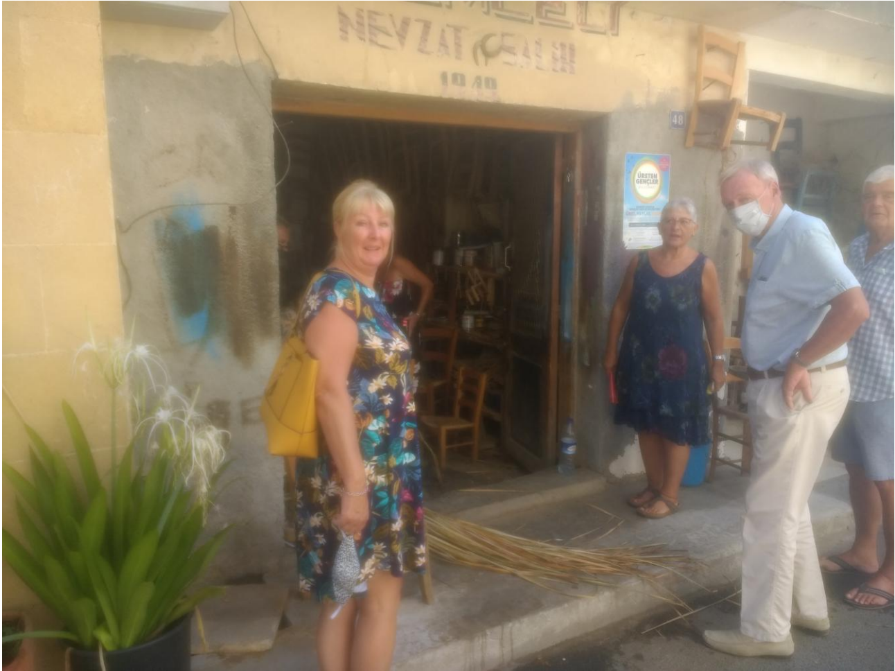
Photographs taken at event